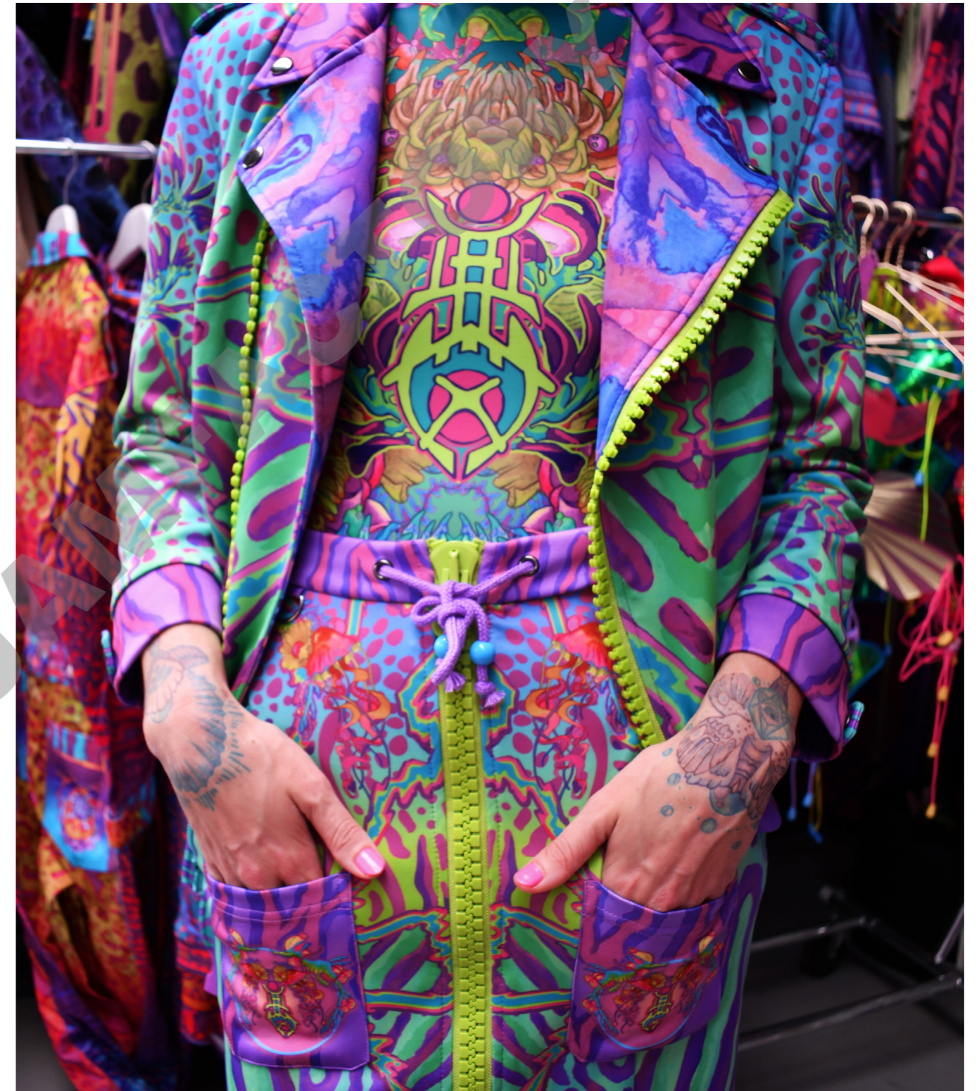
Nixi Killick, Cryptic Frequency Augmented Reality Activated Biker Jacket and Biker Skirt, 2019, scuba knit; Cryptic Frequency Augmented Reality Activated Leotard, 2022, polyester spandex.